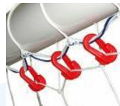
Plastic net clips 2