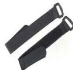
Velcro net straps