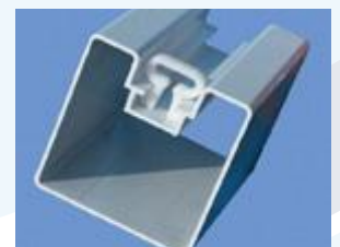
Track box system