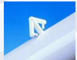
Synthetic Net Hook (UK)