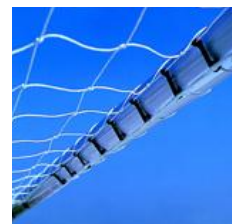
Plastic net clips 1