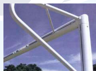
Net track system